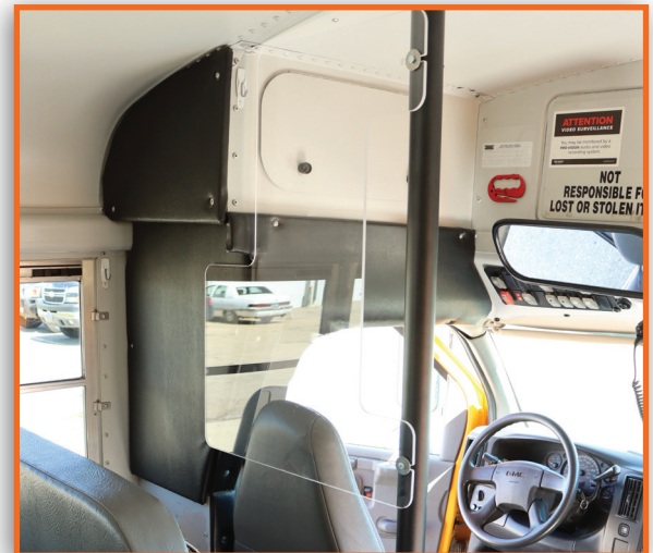
ABB-TYPE C (31.5" width x 40" height) Designed to fit: Type C ("traditional" / "conventional") school buses, Type D ("transit-style") school buses, people mover buses