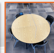
ArmorBoss™ Table Sneeze Guards